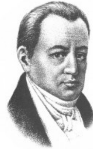
Ivan Kotliarevsky. Eneida

We have a special Ukrainian literature event next at the LRC on 13 July 2021 @ 12:40. Ivan Kotliarevsky is often referred to as the “founder” of modern Ukrainian literature. He created a masterpiece with his literary work, Eneida . Stop by on Wednesday to find out more about Ivan, his works, and other Ukrainian literature!