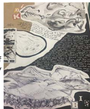
Sketchbook page of observational studies by Alicja Jagodzick