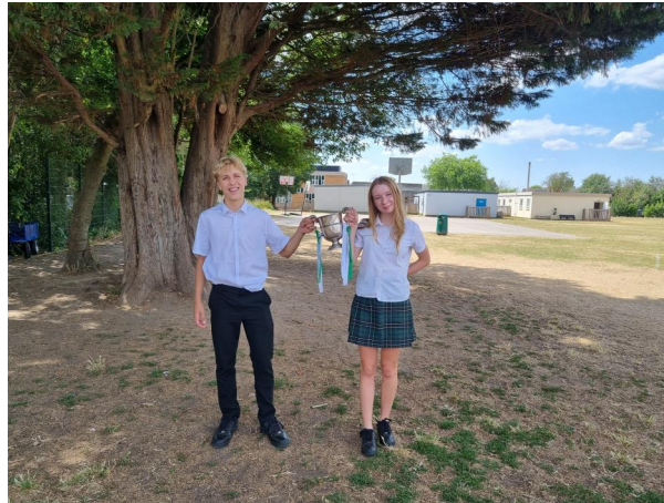
5 - House Winners - Monte Cassino