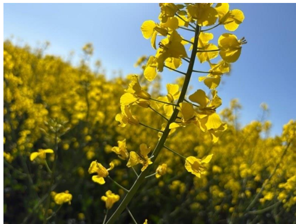
3 - Third place - Harry Sheridan, Monte Cassino