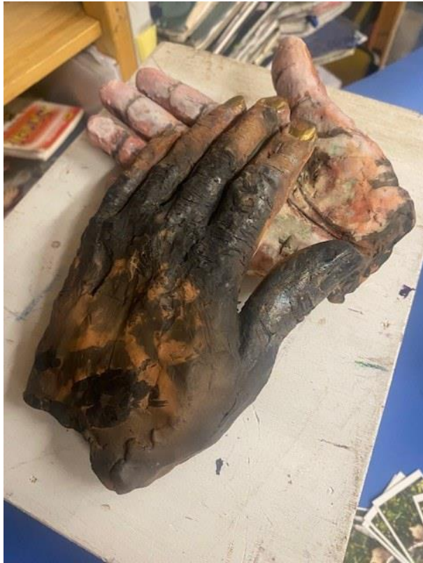
7 - Keeley Chapman's Raku sculpture